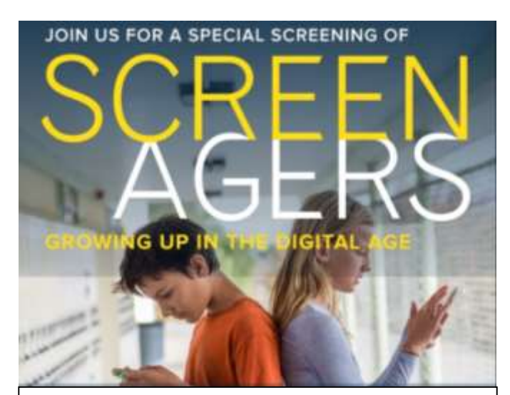
Sept. 15 @ 6:30 PM in the George Cunningham '40 Performing Arts Center for Parents, Students & Faculty

CBHS Parent iPad Handbook: <a href="https://goo.gl/nuRfe4">https://goo.gl/nuRfe4</a>