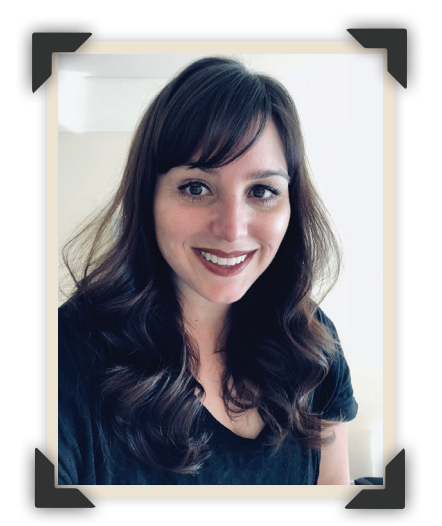
Here I am today!