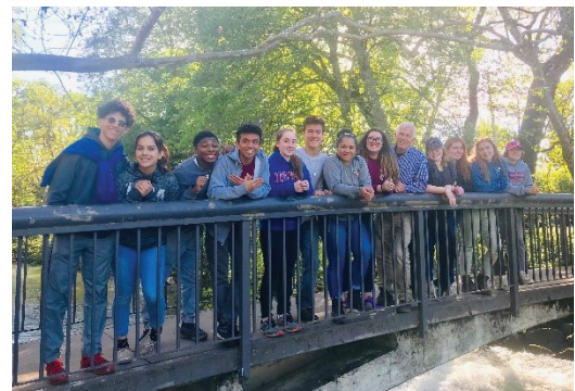
Photo: Resting after a long day of work - Bidwell Park (Chico, CA)